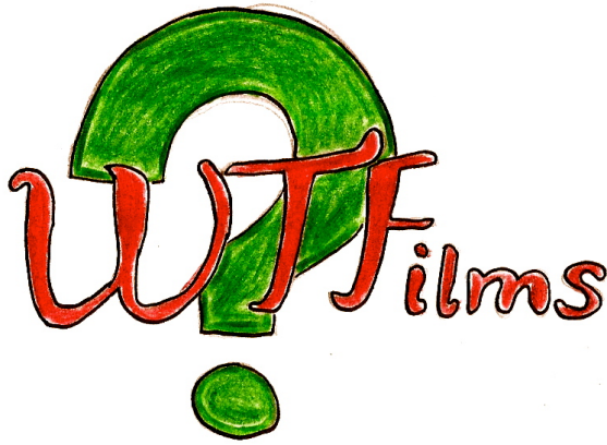
My first drawing

Our final idea was 'WTFilms.' We all agreed that this would be the name of our productions company, so I began by hand drawing a design, then remaking it on Photoshop it different colours.